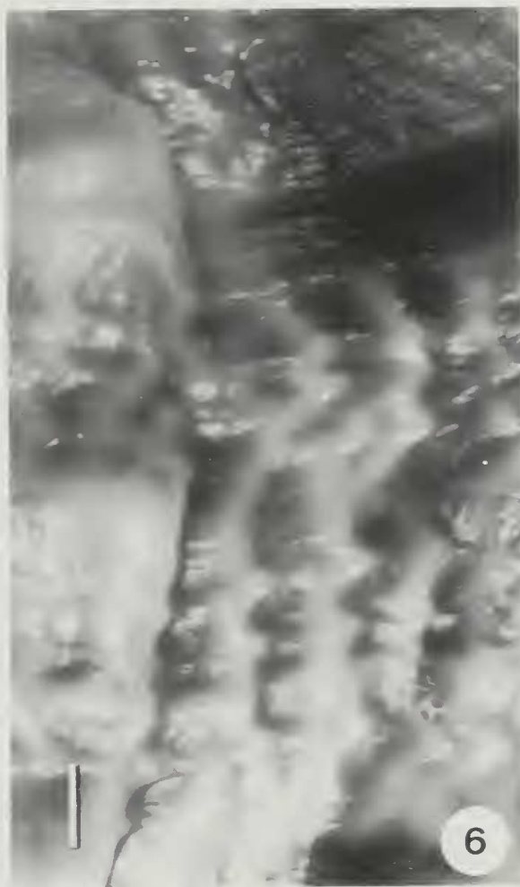
Figure 6. Haustellum barbieri n.sp., holotype, detail of surface sculpture (scale bar 1 mm).

Shell medium sized for the genus, up to 90.4 mm in length, heavy, tuberculate. Spire moderately high with 7 broad, shouldered teleoconch whorls. Protoconch unknown (broken). Suture impressed. First teleoconch whorl lightly eroded; second whorl with 20-22 low, rounded axial ridges; third whorl with rounded axial ridges and earliest varices; fourth to sixth teleoconch whorl with 3 rounded, tuberculate varices, 4 (occasionally 3) nodose, axial ridges between each pair of